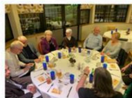
Meeting over Dinner at Cuddington Golf Club

If Rotary sounds like the organisation for you and you feel like volunteering some of your spare time, we'd like to hear from you!